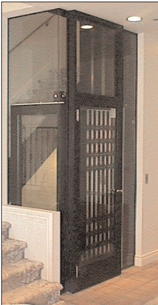
Custom designed glass elevator with Bostwick style scissor gate

No other manufacturer offers a product line this extensive.