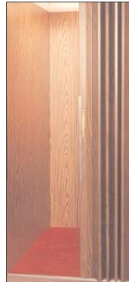
Oak laminate interior with woodfold gate

For more information on the products we manufacturer or pricing, please contact a Sales Representative today at (734) 246-4700 or visit us on the web.